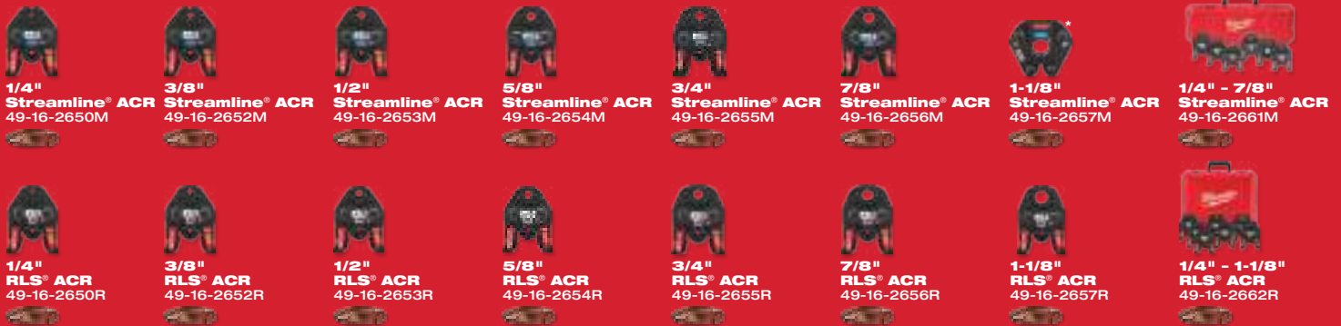
1/4" Streamline® ACR 49-16-2650M 3/8" Streamline® ACR 49-16-2652M 1/2" Streamline® ACR 49-16-2653M 5/8" Streamline® ACR 49-16-2654M 3/4" Streamline® ACR 49-16-2655M 7/8" Streamline® ACR 49-16-2656M 1-1/8" Streamline® ACR 49-16-2657M 1/4" - 7/8" Streamline® ACR 49-16-2661M 1/4" RLS® ACR 49-16-2650R 3/8" RLS® ACR 49-16-2652R 1/2" RLS® ACR 49-16-2653R 5/8" RLS® ACR 49-16-2654R 3/4" RLS® ACR 49-16-2655R 7/8" RLS® ACR 49-16-2656R 1-1/8" RLS® ACR 49-16-2657R 1/4" - 1-1/8" RLS® ACR 49-16-2662R