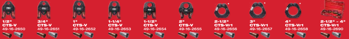
1/2" CTS-V 49-16-2650 3/4" CTS-V 49-16-2651 1" CTS-V 49-16-2652 1-1/4" CTS-V 49-16-2653 1-1/2" CTS-V 49-16-2654 2" CTS-V 49-16-2655 2-1/2" CTS-Vr1 49-16-2656 3" CTS-Vr1 49-16-2657 4" CTS-Vr1 49-16-2658 2-1/2" - 4" CTS-Vr1 49-16-2690