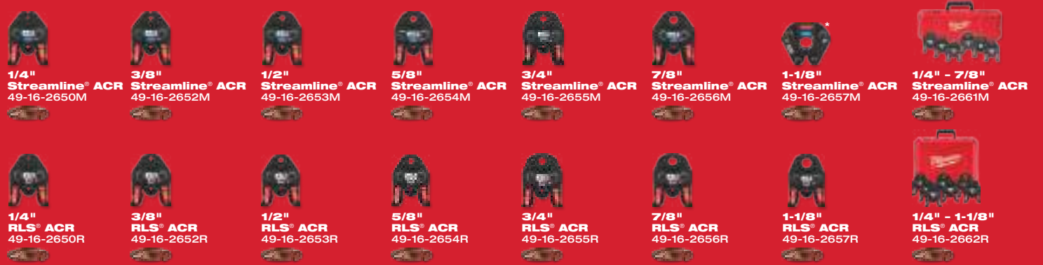
1/4" Streamline® ACR 49-16-2650M 3/8" Streamline® ACR 49-16-2652M 1/2" Streamline® ACR 49-16-2653M 5/8" Streamline® ACR 49-16-2654M 3/4" Streamline® ACR 49-16-2655M 7/8" Streamline® ACR 49-16-2656M 1-1/8" Streamline® ACR 49-16-2657M 1/4" - 7/8" Streamline® ACR 49-16-2661M 1/4" RLS® ACR 49-16-2650R 3/8" RLS® ACR 49-16-2652R 1/2" RLS® ACR 49-16-2653R 5/8" RLS® ACR 49-16-2654R 3/4" RLS® ACR 49-16-2655R 7/8" RLS® ACR 49-16-2656R 1-1/8" RLS® ACR 49-16-2657R 1/4" - 1-1/8" RLS® ACR 49-16-2662R