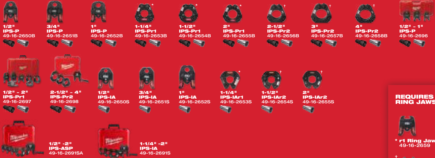
1/2" IPS-P 49-16-2650B 3/4" IPS-P 49-16-2651B 1" IPS-P 49-16-2652B 1-1/4" IPS-Pr1 49-16-2653B 1-1/2" IPS-Pr1 49-16-2654B 2" IPS-Pr1 49-16-2655B 2-1/2" IPS-Pr2 49-16-2656B 3" IPS-Pr2 49-16-2657B 4" IPS-Pr2 49-16-2658B 1/2" - 1" IPS-P 49-16-2696 1/2" - 2" IPS-Pr1 49-16-2697 2-1/2" - 4" IPS-Pr2 49-16-2698 1/2" IPS-IA 49-16-2650S 3/4" IPS-IA 49-16-2651S 1" IPS-IA 49-16-2652S 1-1/4" IPS-IAr1 49-16-2653S 1-1/2" IPS-IAr2 49-16-2654S 2" IPS-IAr2 49-16-2655S 1/2" - 2" IPS-ASP 49-16-2691SA 1-1/4" - 2" IPS-IA 49-16-2691S