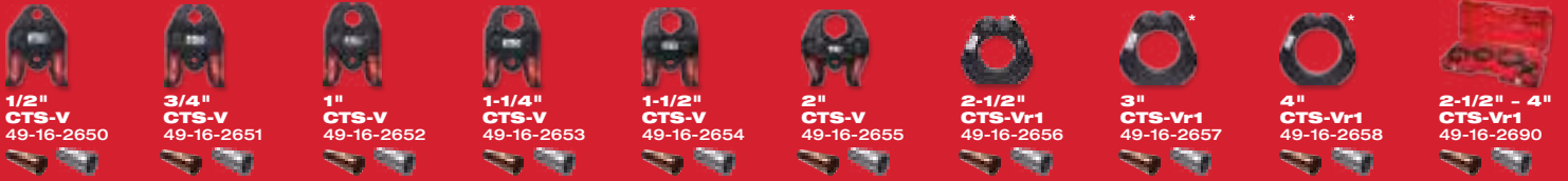
1/2" CTS-V 49-16-2650 3/4" CTS-V 49-16-2651 1" CTS-V 49-16-2652 1-1/4" CTS-V 49-16-2653 1-1/2" CTS-V 49-16-2654 2" CTS-V 49-16-2655 2-1/2" CTS-Vr1 49-16-2656 3" CTS-Vr1 49-16-2657 4" CTS-Vr1 49-16-2658 2-1/2" - 4" CTS-Vr1 49-16-2690