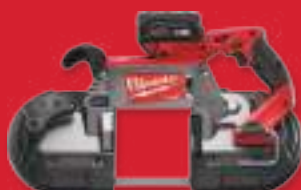
M18 FUEL™ Deep Cut Band Saw Kit 2729-22