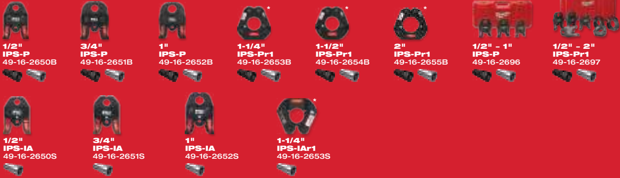
1/2" IPS-P 49-16-2650B 3/4" IPS-P 49-16-2651B 1" IPS-P 49-16-2652B 1-1/4" IPS-Pr1 49-16-2653B 1-1/2" IPS-Pr1 49-16-2654B 2" IPS-Pr1 49-16-2655B 1/2" - 1" IPS-P 49-16-2696 1/2" - 2" IPS-Pr1 49-16-2697 1/2" IPS-IA 49-16-2650S 3/4" IPS-IA 49-16-2651S 1" IPS-IA 49-16-2652S 1-1/4" IPS-IAr1 49-16-2653S