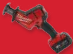
M18 FUEL™ HACKZALL® One-Handed Reciprocating Saw Kit 2719-21