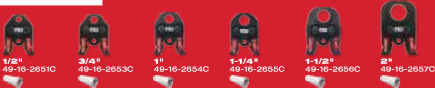
1/2" 49-16-2651C 3/4" 49-16-2653C 1" 49-16-2654C 1-1/4" 49-16-2655C 1-1/2" 49-16-2656C 2" 49-16-2657C