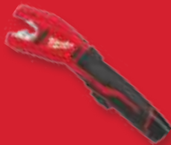
M12™ Copper Tubing Cutter Kit 2471-21