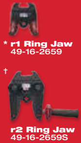
* r1 Ring Jaw 49-16-2659