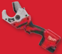
M12™ Plastic Pipe Shear Kit 2470-21