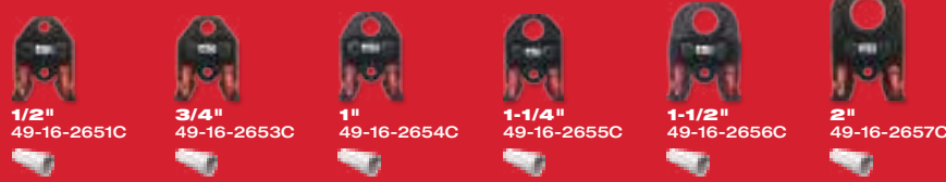
1/2" 49-16-2651C 3/4" 49-16-2653C 1" 49-16-2654C 1-1/4" 49-16-2655C 1-1/2" 49-16-2656C 2" 49-16-2657C